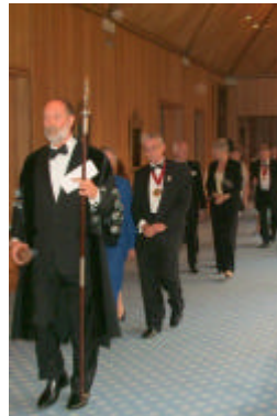
The Court and Speakers parade into Dinner

Following the meal, the Master announced the news that the Guild has raised £75,000 to date for its charitable fund – the half-way point in the path from a Guild to a Company with full Livery status as the final step. We will continue to build that core fund while investing back into the community through education and charitable support.