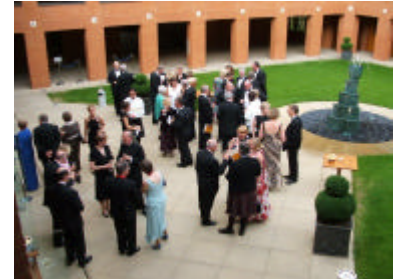
Guests enjoy the reception in the courtyard at Haberdashers' Hall

Our Summer Banquet on 21 June was the perfect midsummer night. An evening champagne reception was followed by an excellent dinner in the Haberdashers' Hall, the City's newest livery hall.